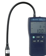
7899 Portable combustible gas leak detector