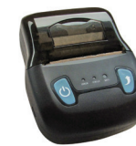
AAST04 Bluetooth printer