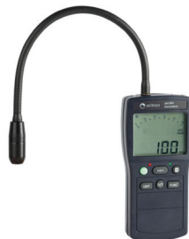
7900 Portable combustible gas detector with rechargeable battery